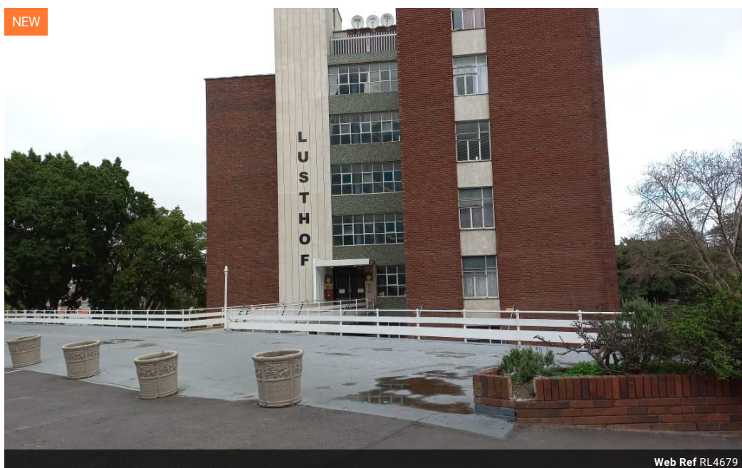
Web Ref RL4679