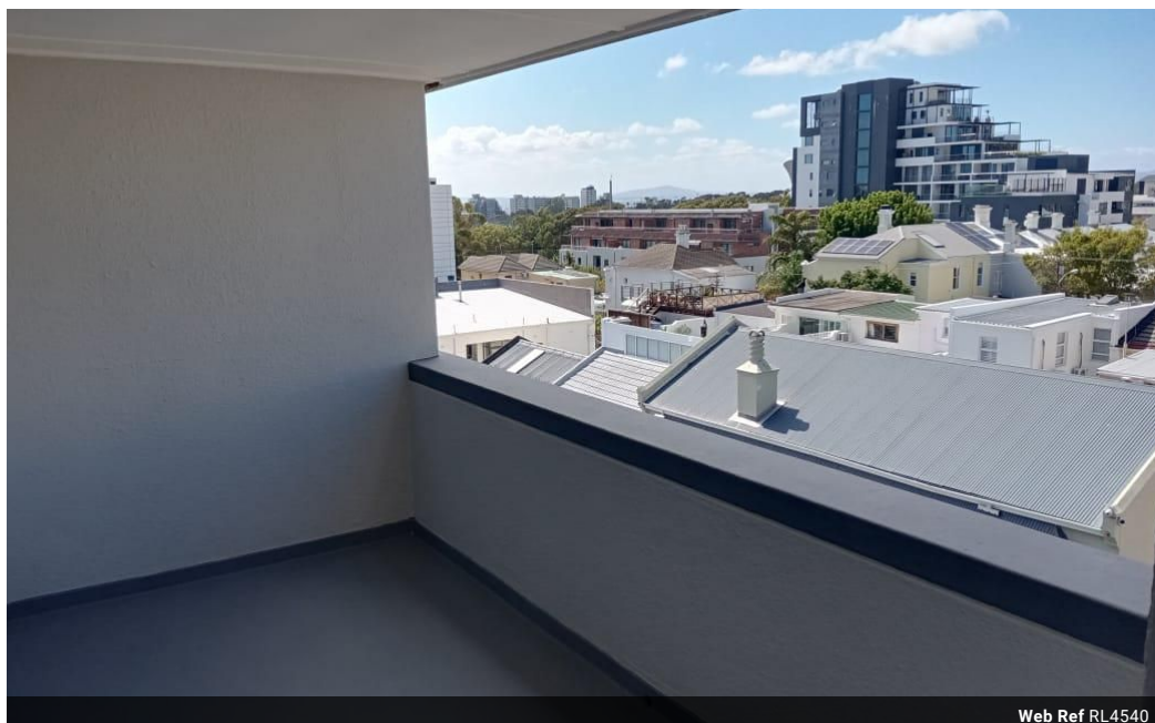
Web Ref RL4540

3rd Floor, Bank Chambers, 144 Longmarket Street, Cape Town, 8001