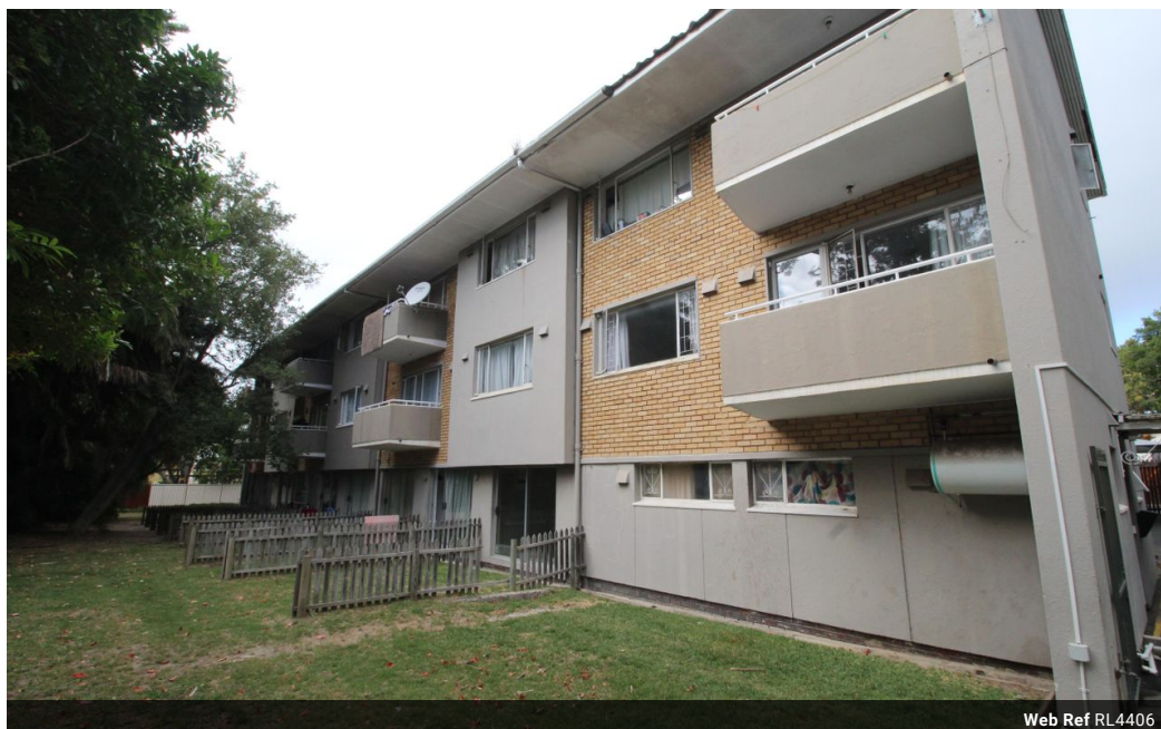
Web Ref RL4406

3rd Floor, Bank Chambers, 144 Longmarket Steet, Cape Town, 8001