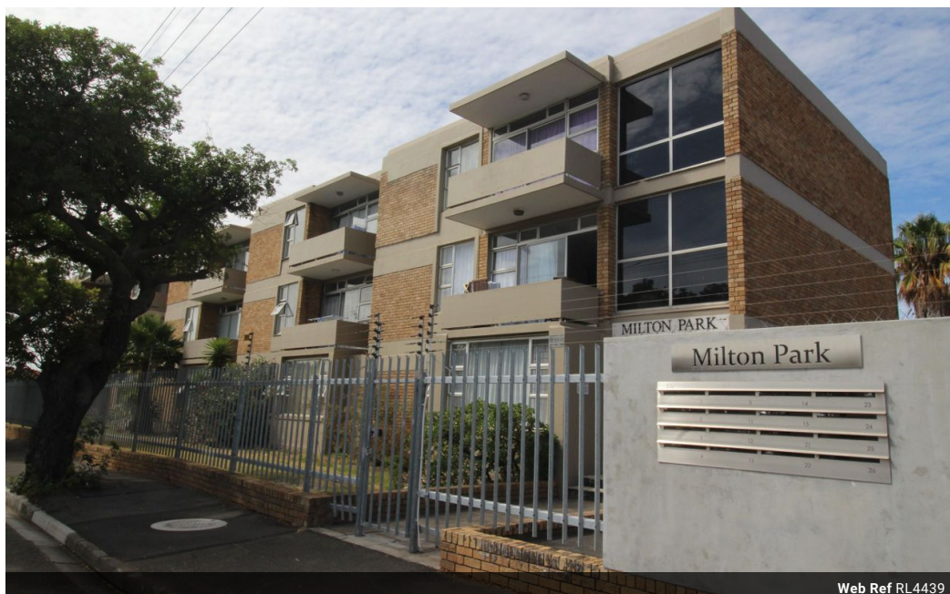
Web Ref RL4439

3rd Floor, Bank Chambers, 144 Longmarket Street, Cape Town, 8001