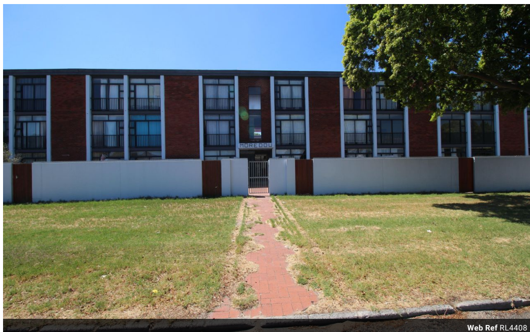
Web Ref RL4408

3rd Floor, Bank Chambers, 144 Longmarket Street, Cape Town, 8001