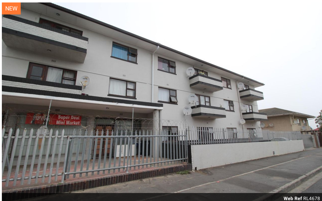
Web Ref RL4678

3rd Floor, Bank Chambers, 144 Longmarket Street, Cape Town, 8001