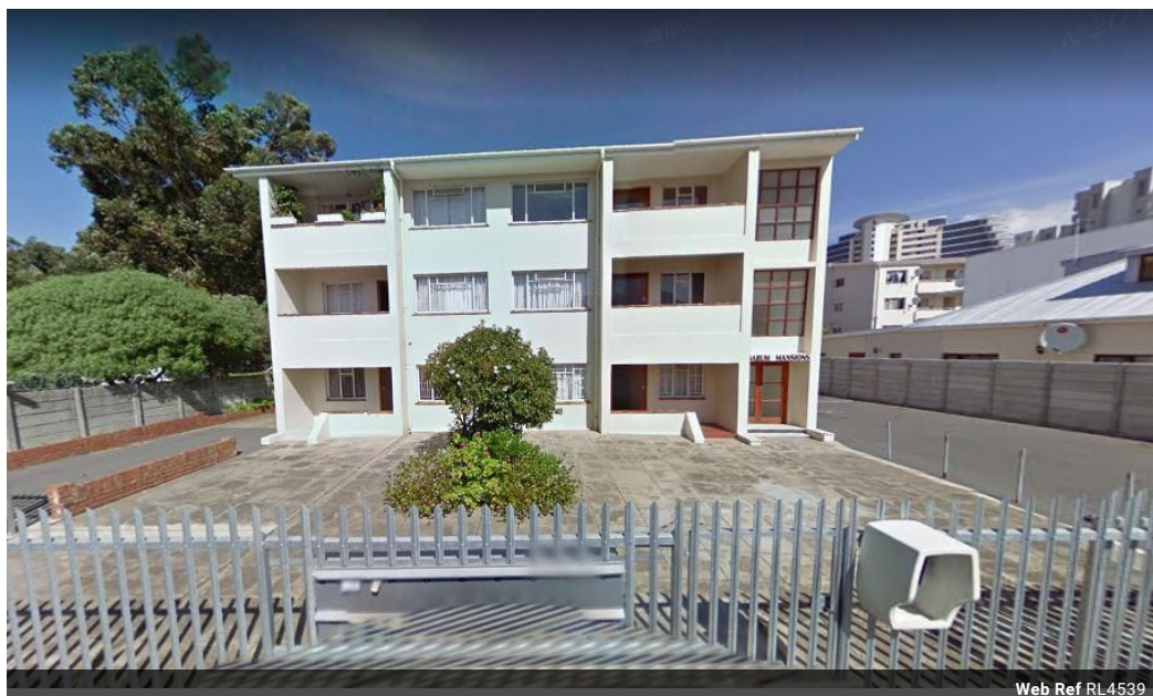
Web Ref RL4539

3rd Floor, Bank Chambers, 144 Longmarket Street, Cape Town, 8001